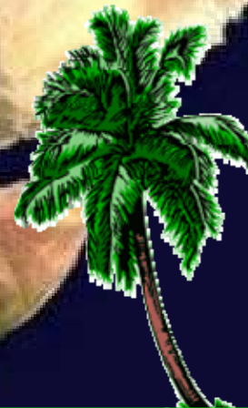
UAE Date Palm Global Network