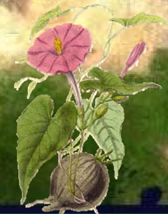
Jordan Medicinal & Aromatic Plants Network