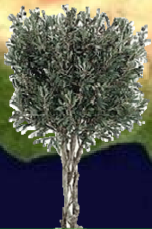
Tunisia Olive Network