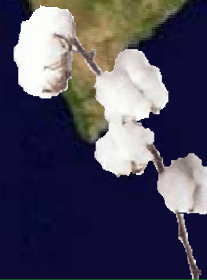
Iran Int. Reg. Cotton Network