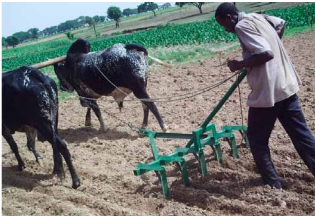
Photo 1: Drill marker fabricated to improve rice planting methods in the NGS IP

Significant at the 10% level; ** significant at the 5% level; *** significant at the 1% level.